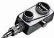
5-64017-00 Self Timer 8

These are cable releases which are essential for a vibrationless shutter trip at slow shutter speeds or for a greater convenience when using the camera on Copy Stand 4 or a tripod.