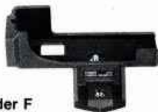
5-03111-00 Camera Holder F

The Macrolite ML-1 is an outstanding electronic flash system designed especially for close-ups with Canon cameras and lenses. A unique characteristic of the Macrolite ML-1 is the use of two symmetrical flash tubes which may be fired simultaneously or individually to create different effects. It also may be used with the Canon FD 80-200mm f4.0 zoom lens, with the FD 50mm f3.5 or FD 100mm f4.0 Macro lenses which is especially useful in medical or dental photography.