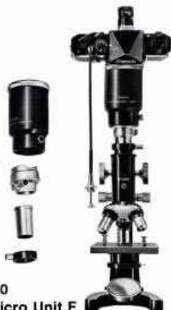
4-26201-20 Photo Micro Unit F

For the photographer wishing to convert his Slide Duplicator to accept lenses of different filter size, these accessory Attachment Rings are provided. For example, the owner of the Slide Duplicator 48 may use the accessory with lenses having filter sizes of 55mm and/or 58mm with the simple addition of extra Attachment Rings.