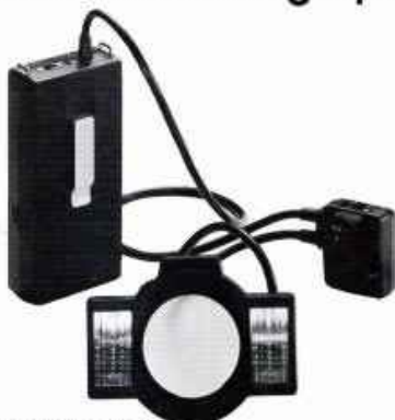
C50-0301-221 Macrolite ML-1 Set (Consists of Macrolite ML-1, Wide Adapter ML-1, Macrolite Adapters 55 and 52, Tightening Rings 55 and 52)

The Macrolite ML-1 is an outstanding electronic flash system designed especially for close-ups with Canon cameras and lenses. A unique characteristic of the Macrolite ML-1 is the use of two symmetrical flash tubes which may be fired simultaneously or individually to create different effects. It also may be used with the Canon FD 80-200mm f4.0 zoom lens, with the FD 50mm f3.5 or FD 100mm f4.0 Macro lenses which is especially useful in medical or dental photography.