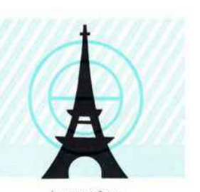
in correct focus

For convenient focusing, the frosted surface of the rangefinder can be used. For more critical focusing, the splitimage rangefinder lines should be used. As soon as the split-image appears in perfect alignment, the lens is critically focused.