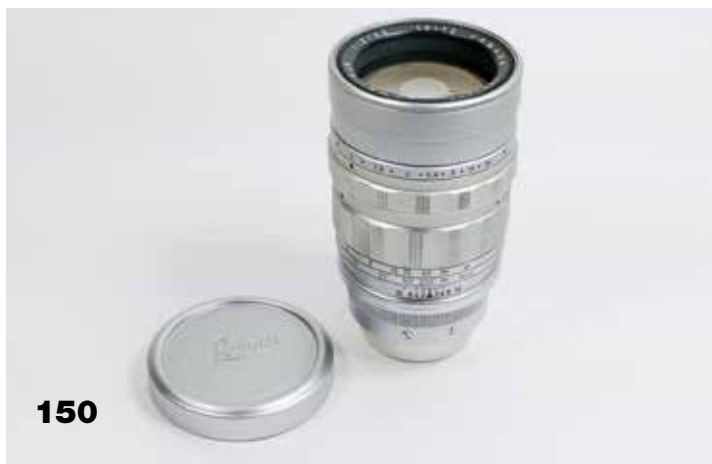
150. 90mm Summicron f2 Canada Nr. 1651488 in silver chrome finish, rarely found in Leica screw mount, with caps.