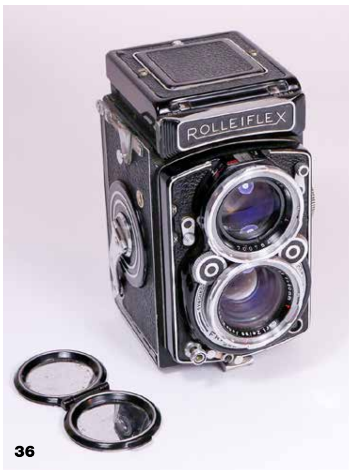
36. Rolleiflex 2,8 B (Type 1) with Zeiss Jena 80mm Biometar f2,8 Nr. 3440256. This camera had its serial number removed but is otherwise in fine condition.