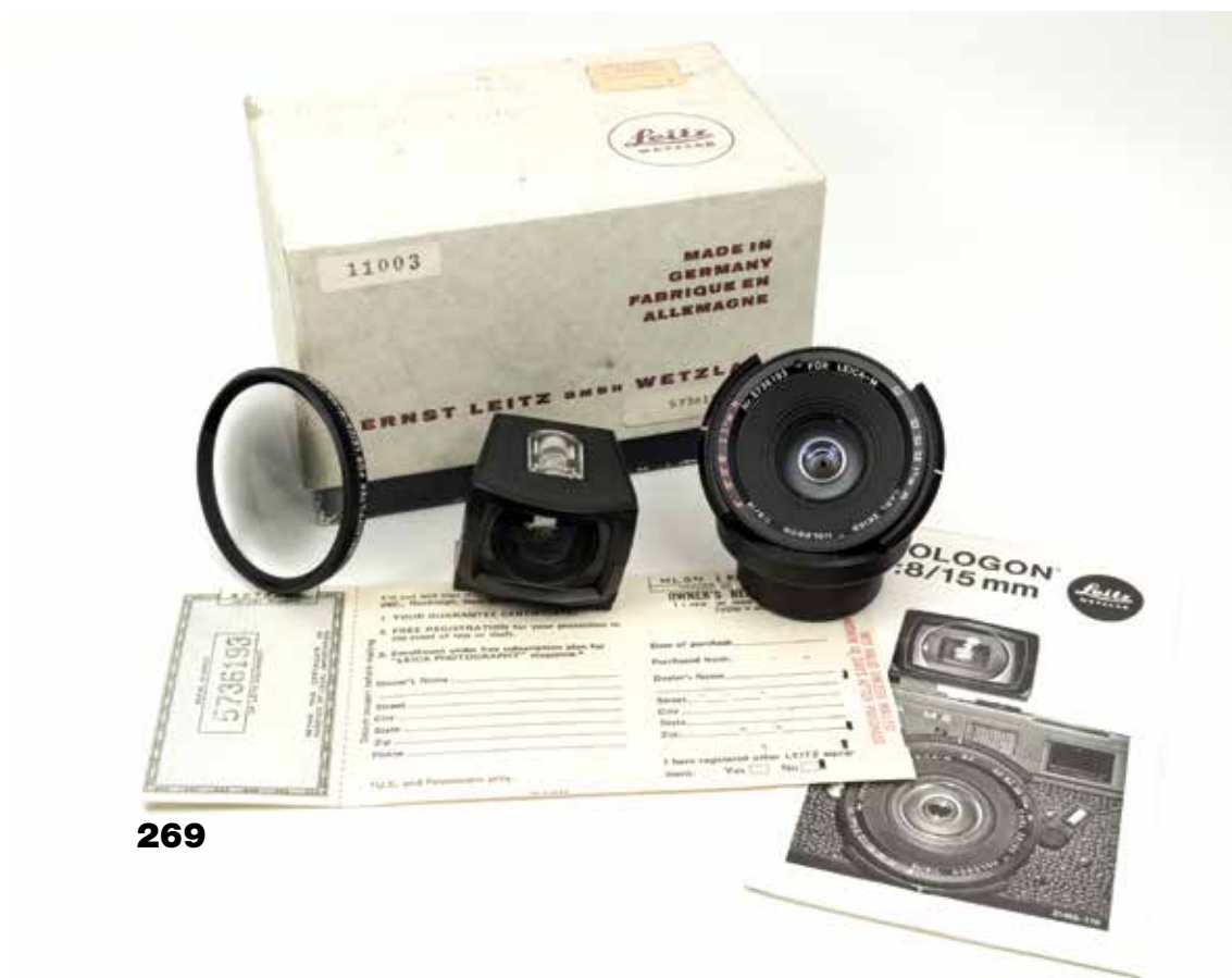
269. 15mm Hologon f8 Nr. 5736193 in its original box and apparently unused. With 15mm spirit-level viewfinder, Neutral Density filter, and even the complete and blank warranty card! Very rare, very desirable.