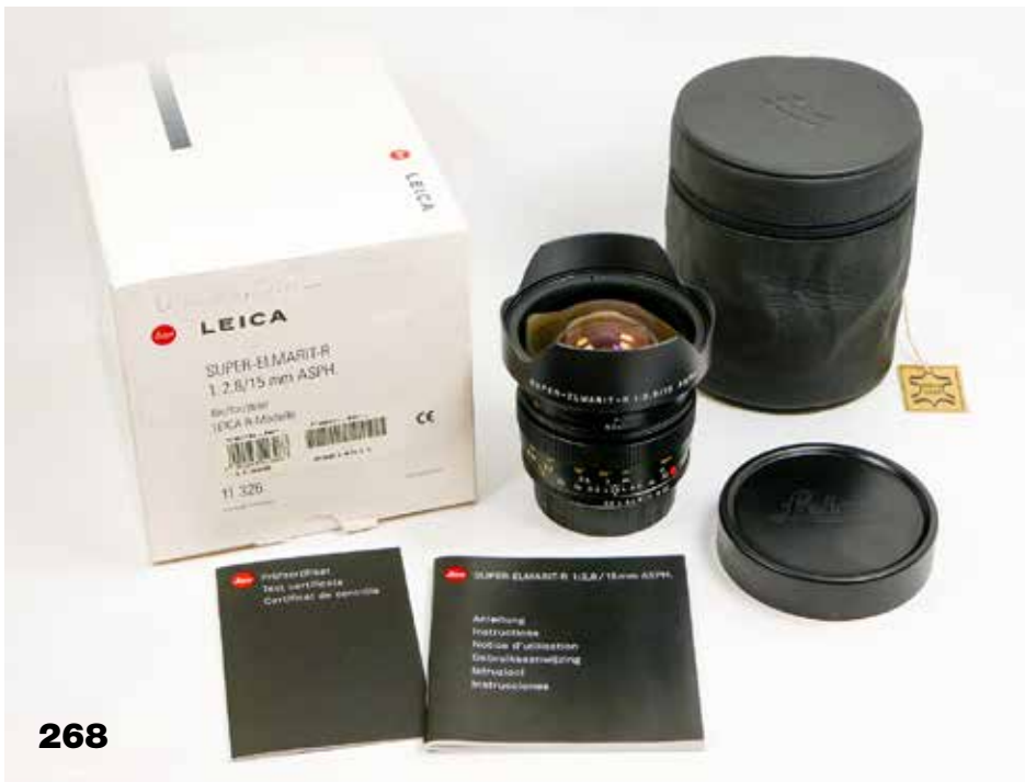
268. 15mm Super-Elmarit-R f2,8 ASPH ROM Nr. 3914511 complete in box with caps, instruction booklet, test certificate and fitted leather case. A very rare lens in stunning condition.