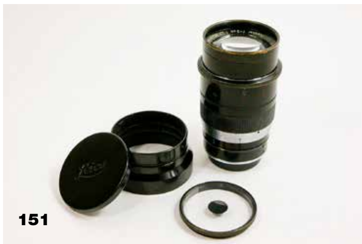
151. 90mm Thambar f2,2 Nr. 226184 complete with lens shade, caps and spot filter.

This is the famous 1940s portrait lens that created so many silky, soft portraits and captivated so many photographers over the years.