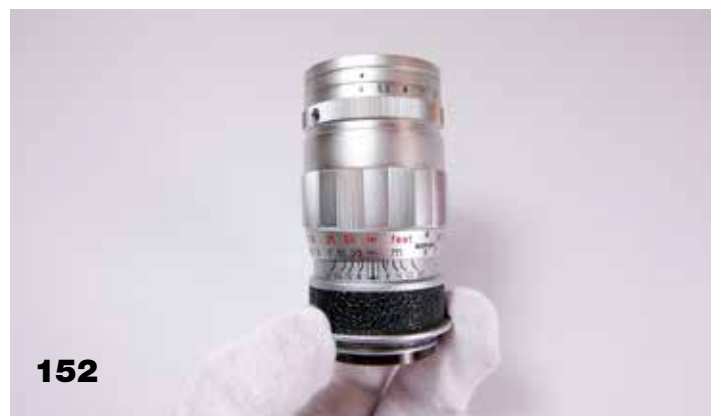
152. 90mm "Parallel" Elmar f4 Nr. 2090480. A rare lens, and this is the beautiful copy we've ever seen.