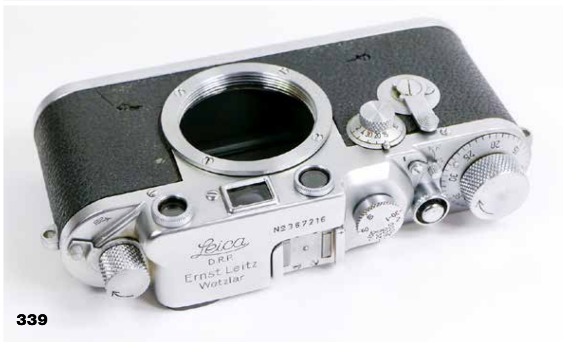
339. Leica IIIId Nr. 367216. The rarest of all Leica screw mount cameras, this camera was made in 1944 and is one of the last 100 or so Leica IIIId cameras made, and one of only 427 ever made between 1939-1947. The vulcanite is cracked but stable and the shutter is working. Exceedingly rare.